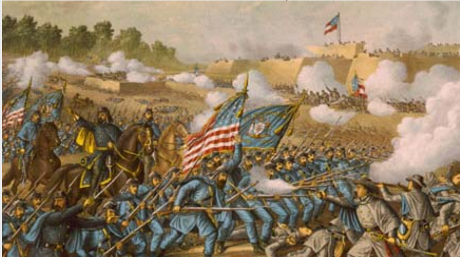
From the National Park Service Sesquicentennial Commemoration

together host events in honor of the 150 th anniversary of the Civil War.