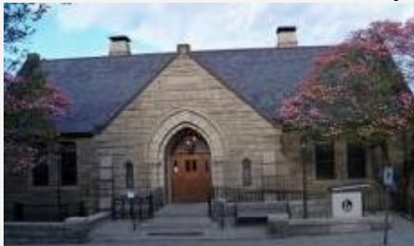
82 Peirce Street, East Greenwich, Rhode Island 02818

and Battery "B" 1 st Rhode Island Light Artillery