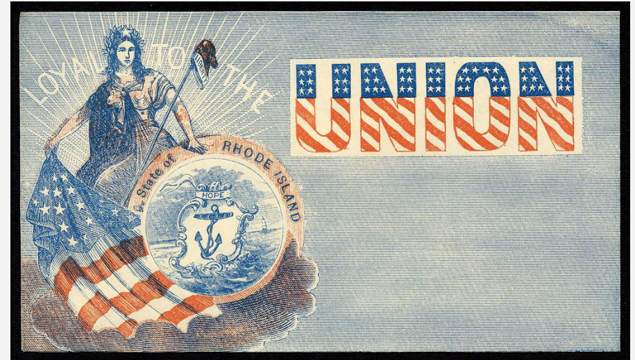
Civil war postcard – Rhode Island's / New York Historical Society Collection

"From 1861 to 1865, the American union was broken as brother fought brother in a Civil War that remains a defining moment in our nation's history. Its causes and consequences, including the continuing struggle for civil rights for all Americans, reverberate to this day. From the battlefields to the homefront, the cost of the war was steep...its lessons eternal."