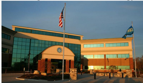
One New England Tech Boulevard, East Greenwich, Rhode Island 02818-1205